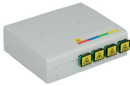
Wall-mounted fibre optic outlet NGO-24