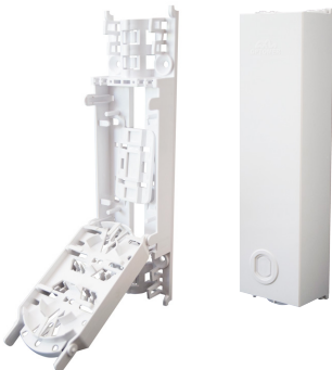
Branch box RKLD-12