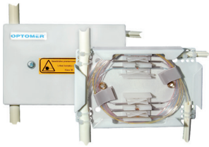
Branch box OKLDS