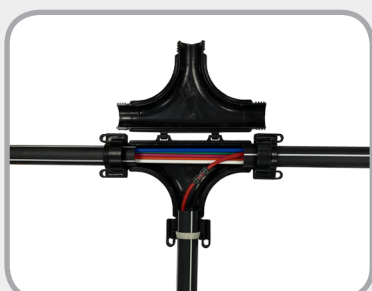
Open Branching Closure T-type