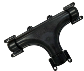
Branching Closures for Connecting T-type Microduct Bundles