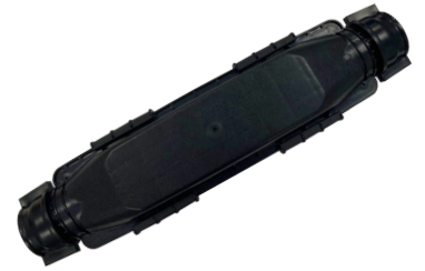
Branching Closures for Connecting I-type Microduct Bundles