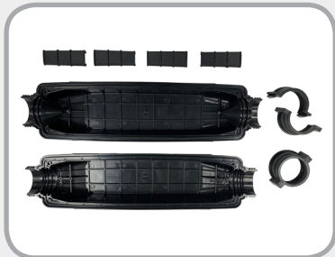
Open Branching Closure I-type