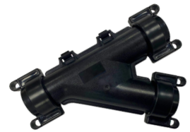
Branching Closures for Connecting Y-type Microduct Bundles