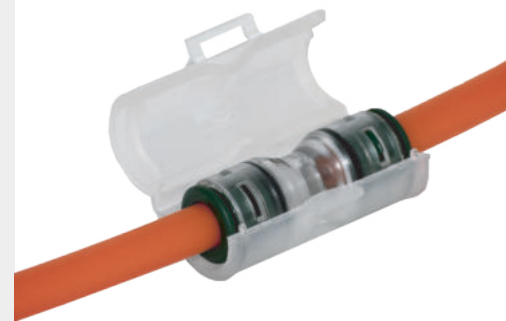
Straight connector with a cap to bury in the ground