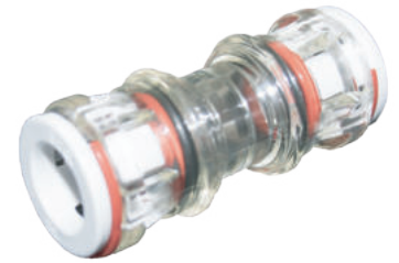
Universal Straight Connector