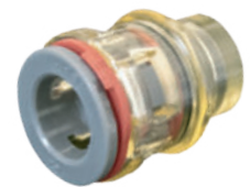
Universal Straight Plug