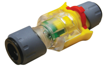
Gas-Block Straight Connector