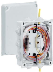
Wall mounted splice box NMS-6