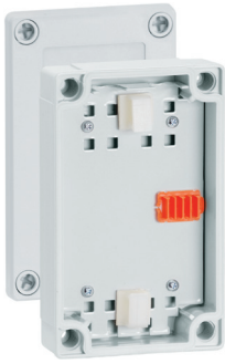
Wall mounted splice box NMS-4

NMS-6 - 6 splice wall mounted splice box