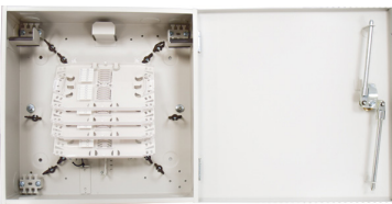
Wall-mounted access network distribution splice box PRW-64U