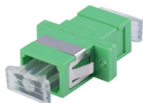
Złącza SC i Adapter SC APC z przezroczystymi zatyczkami