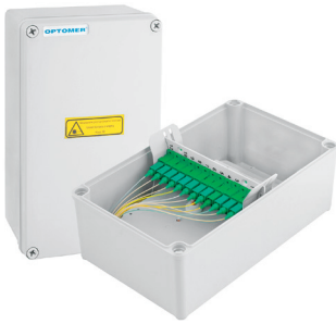
Outdoor fibre optic distribution box PSH-3/12