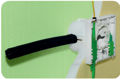
Wall-Mounted Fibre Optic Outlet NGO-12