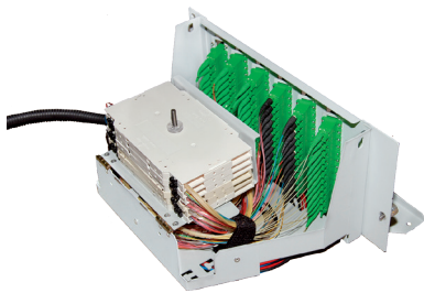
Module MPK-72 (for PSU-1)