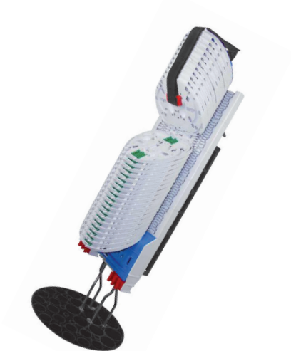
FDN fibre optic splice closure with IR system

FDNIR-C - fibre optic splice closure FDN IR with Integrated Routing system, 36 splice trays SE (12 splices each), cover type C