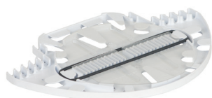
SMF splice tray