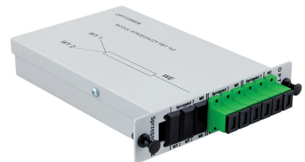
Two 1x2 FBT couplers in MPP0-1 module