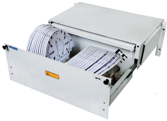
19" Splice panel BP-19/288