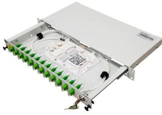
19" Patch panel PS-19