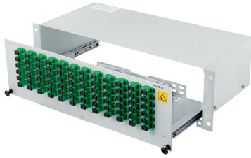
19" Patch panel PS-19/72/3U