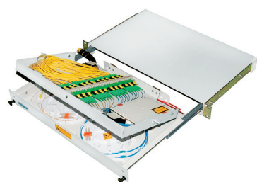
BPK-19 19" Distribution panel

BPK-19/24/1 - 19" patch panel, capacity 24xE-2000/SC adapters, front fixing